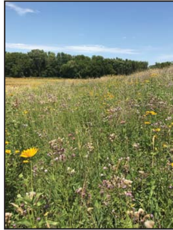
Riverview Circle – 2017