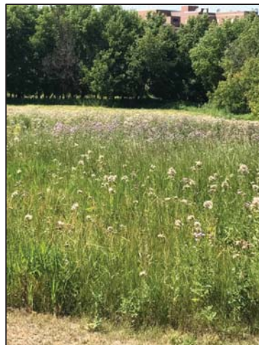
North River Drive – 2017