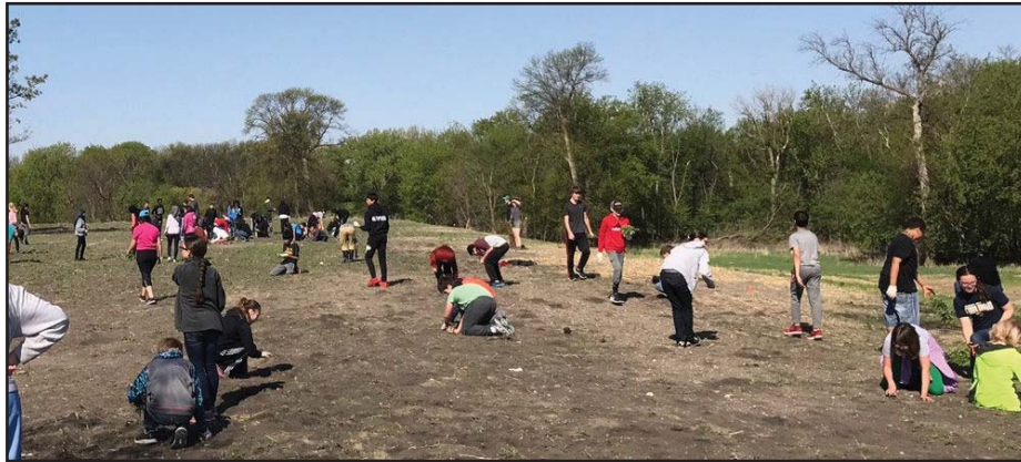
Student Planting Event - 2017