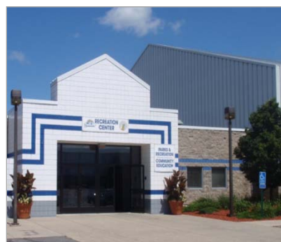
Hutchinson Recreation Center: Improved lighting levels, distribution, appearance, and longer life expectancy