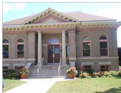
Hutchinson Library: Improved lighting levels and lower operating costs