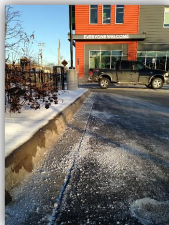
Grocery store parking lot in Minneapolis.

Deicing salts on parking lots pollute water, soils, and damage property. Often more parking means more pollution.