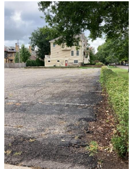
Church parking lot across the street from the three houses in photo above. While appreciated by parishioners, the parking lot generates runoff, heat, and no revenue for the city.