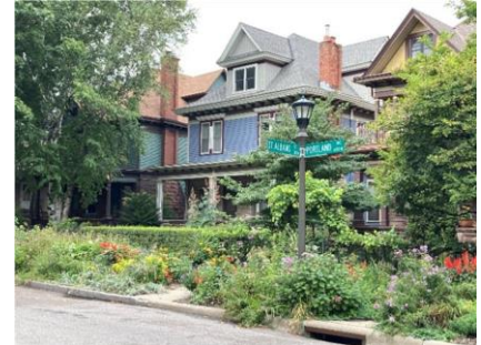
Three houses on Portland Avenue in Saint Paul generate approximately $28,000 annually in property tax revenue.

Three houses on Holly Avenue in Saint Paul pay property taxes that contributes to city and county services including schools, parks, and road repair. Across the street on a similar sized parcel of land, sits a church-owned parking lot that is used infrequently.