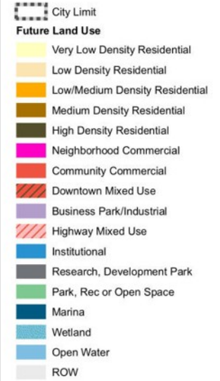
Figure 2.11: Future Land Use